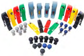
ELECTRODES & RUBBER BULBS