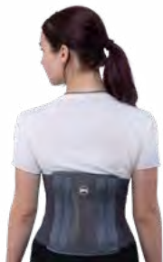
Contoured Lumbar Support