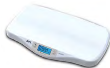
BABY WEIGHING SCALE