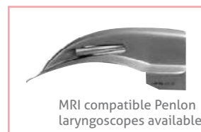
MRI compatible Penlon laryngoscopes available