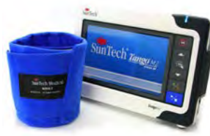
TANGO acquisition unit