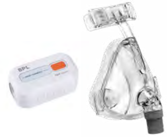
CPAP/ BiPAP Accessories