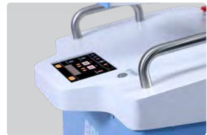
Intuitive & User friendly 7" Full Touch Control Panel