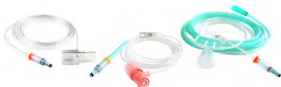
NOMO LINE / SAMPLING LINE