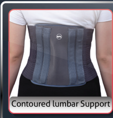
Contoured lumbar Support